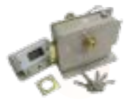
Electric Rimlock set for side gate