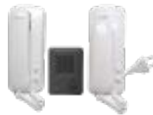
1 to 1 AC doorphone 1 to 2 AC doorphone

Accessories : Push button plate, additional remote control transmitter.