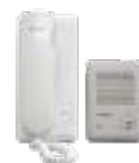
1 to 1 battery DC doorphone