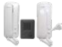
1 to 1 AC doorphone 1 to 2 AC doorphone

Accessories : Push button plate, additional remote control transmitter.